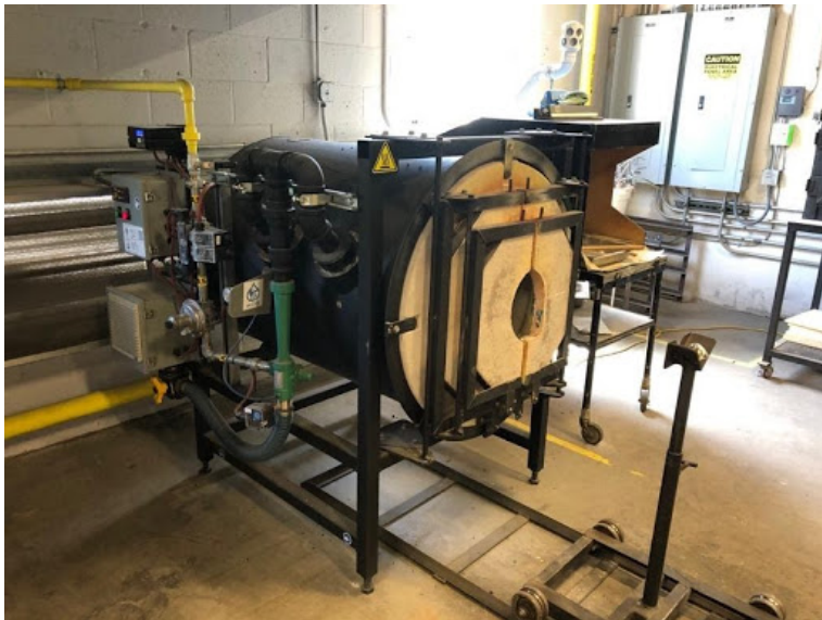
Small Glory Hole