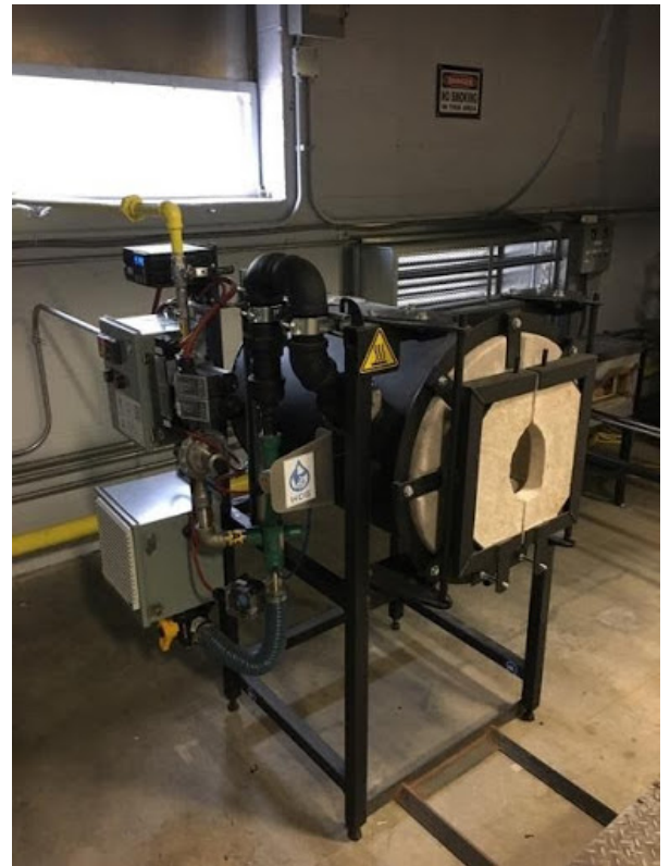
Large Glory Hole

Day Time Discount: 15% applied to glory hole rental for at least 5 hours scheduled Mon-Fri before 5pm